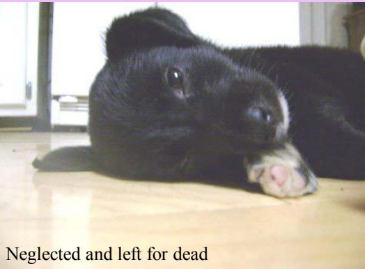
Neglected and left for dead