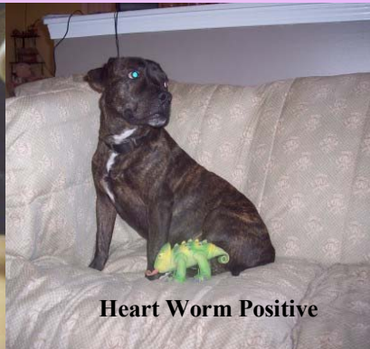
Heart Worm Positive