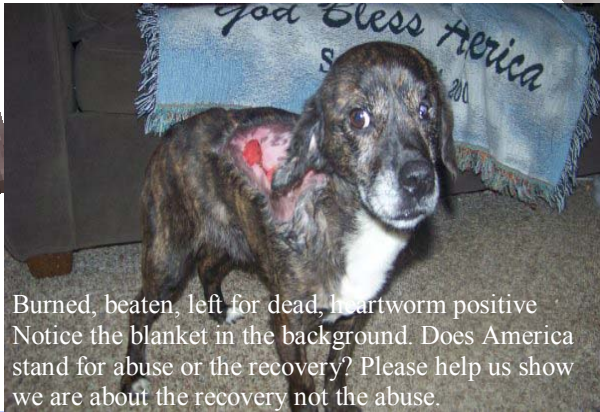
Burned, beaten, left for dead, heartworm positive Notice the blanket in the background. Does America stand for abuse or the recovery? Please help us show we are about the recovery not the abuse.