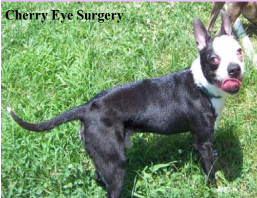
Cherry Eye Surgery